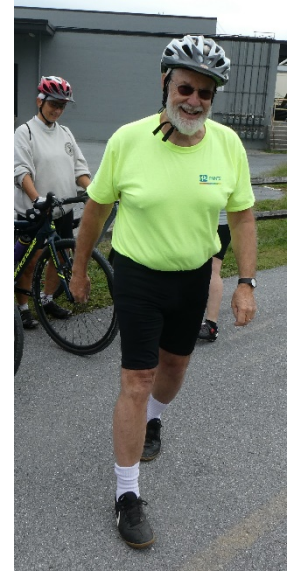
impromptu outing) on a